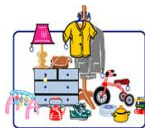
Trash & Treasures Sale