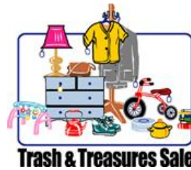
Trash & Treasures Sale

FRIENDS OF APPALACHIA 2015 DENTAL SUPPLY DRIVE provides toothpaste, toothbrushes, dental floss to assist the dire need of improved oral hygiene for impoverished children in Central Appalachia. Please leave your donations in the FOA box in Dodd Hall. If you wish to make a monetary gift, please mark your check or envelope “FOA.”