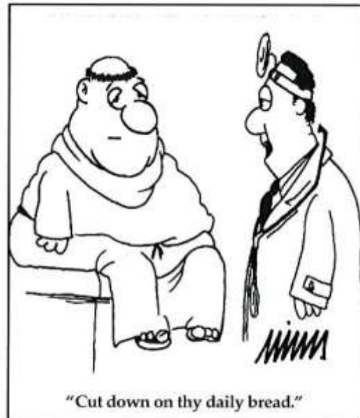
from The Joyful Noiseletter