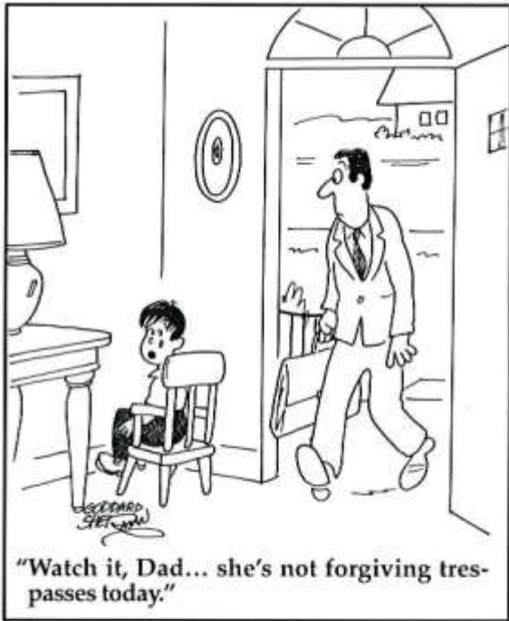
from The Joyful Noiseletter ©1999 Goddard Sherman Reprinted with permission