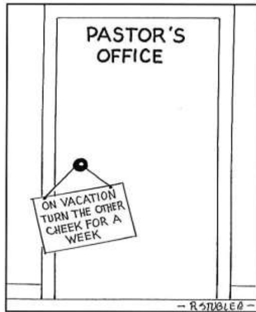
from The Joyful Noiseletter

SEE THE WEEKLY CALENDAR FOR OUR MEETING SCHEDULE.